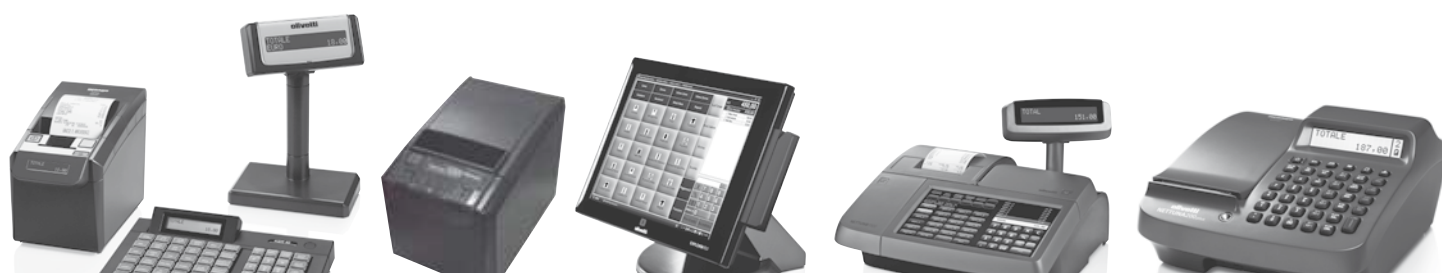
FISCAL AND RETAIL PRINTERS